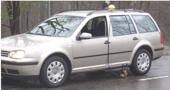
The GPR system mounted in a car, with the GPR antenna underneath the rear door and the GPS antenna on the roof.

The investigation was carried out with the RAMAC CU11 Control unit and the 1.6 GHz shielded antenna, with the RAMAC Monitor XV11 for data acquisition.