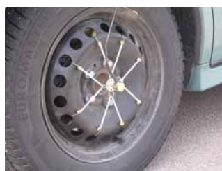
Encoder mounted on a wheel.